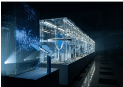
Festo Incredible Machine_dark